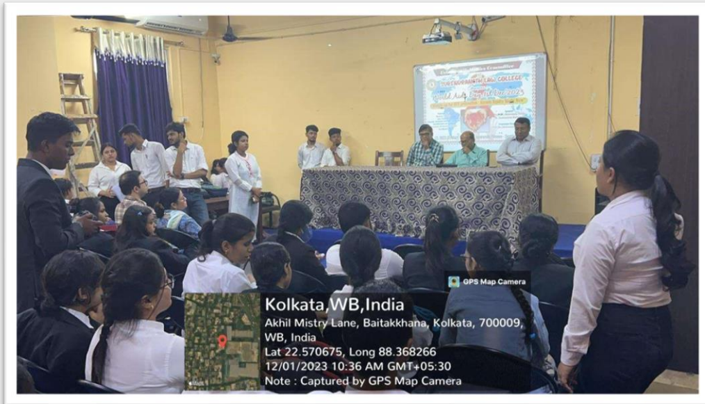
Kolkata, WB, India Akhil Mistry Lane, Baitakkhana, Kolkata, 700009, WB, India Lat 22.570675, Long 88.368266 12/01/2023 10:36 AM GMT+05:30 Note : Captured by GPS Map Camera