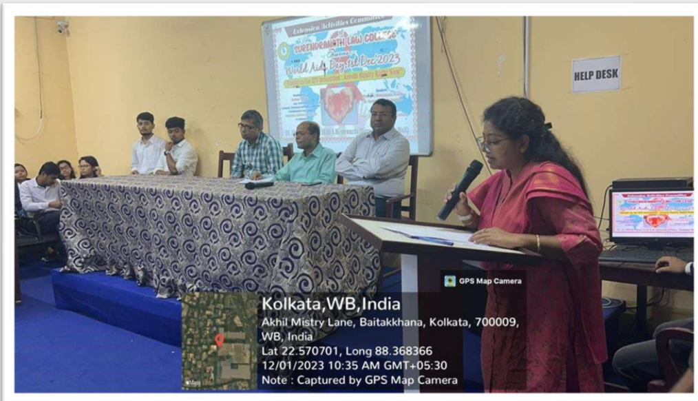
Kolkata, WB, India Akhil Mistry Lane, Baitakkhana, Kolkata, 700009, WB, India Lat 22.570701, Long 88.368366 12/01/2023 10:35 AM GMT+05:30